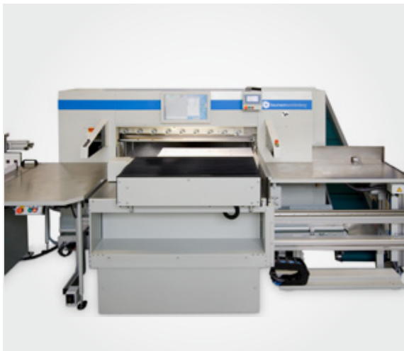
Automatic front-table feeding system

After the first cut, the ream can be turned automatically by 90°. Up to 4 cuts can be carried out automatically.