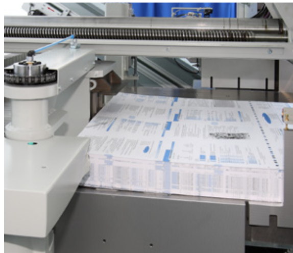
Automatic turning of the ream on the rear-table; up to 4 cuts are possible without any operator's intervention.