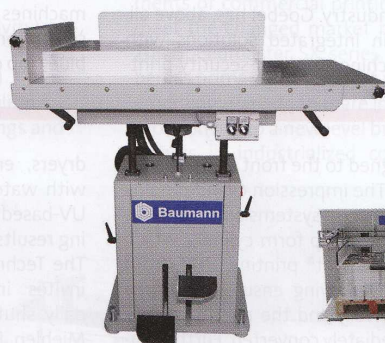
the BAB e jogging machine, and