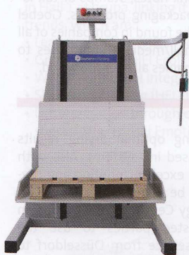
The Economy line comprises, among others, a pile lift ...

In cooperation with GTS GmbH, Baumann has developed a pile turner which is able to determine the amount of sheets by counting. A tab inserter for order picking is also available as an option.