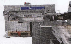
an unloading station